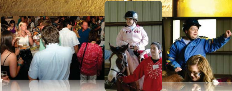
Supporting therapeutic riding for people with disabilities

Join us for a fabulous evening of wine/beer tasting, silent/live auctions, dinner featuring wine/beer provided by Oliver Winery and Bloomington Brewing Company as well as a non-alcoholic refreshments courtesy of Roots on the Square. Feast on hors d'oeuvres while listening to the PALS Jazz Trio, and bidding on over 80 silent auction items and 15 live auction items such as park passes to Walt Disney World, vacation packages including trips to Italy and Grand Cayman, gift certificates from many popular Bloomington businesses and restaurants, artwork from local artists, and much more!