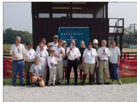
A successful day at the Special Olympics!

"Thank you to the volunteers, staff, riders, parents, family members and horses for making the weekend so successful!"