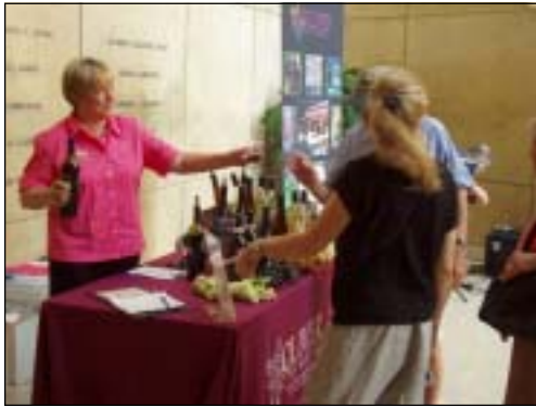
Oliver Winery staff member serves wine