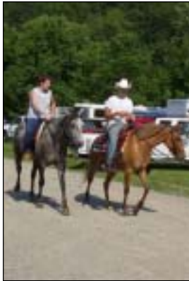
Riders hit the trail