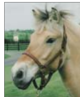
Brynja, our new 5-year-old Norwegian Fjord